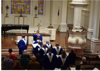
Sanctuary Choir processing, Stanford Vespers 10.22.23