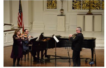
Music for a Purpose Concert for KRM 11.2.23