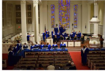
Reformation Sunday with Choir, Bells, Brass & Organ 10.29.23