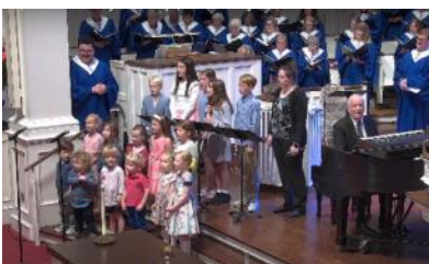
Our Choirs singing in Worship!