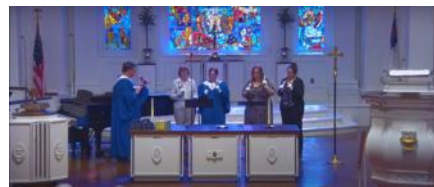
Austin Bell Players Ringing the Hour