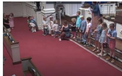
3 yrs & 4th graders getting their Bibles