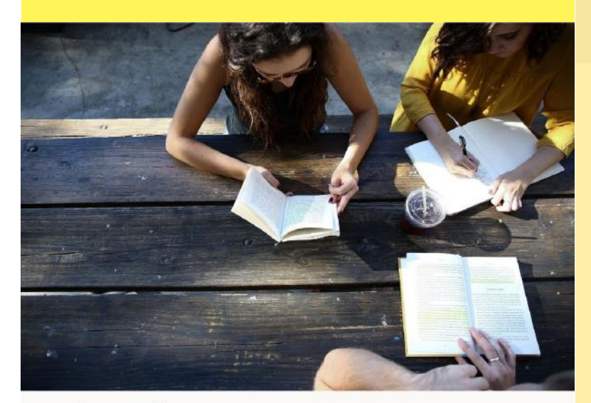
HIGH SCHOOL GIRLS BIBLE STUDY