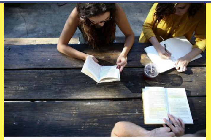
HIGH SCHOOL GIRLS BIBLE STUDY