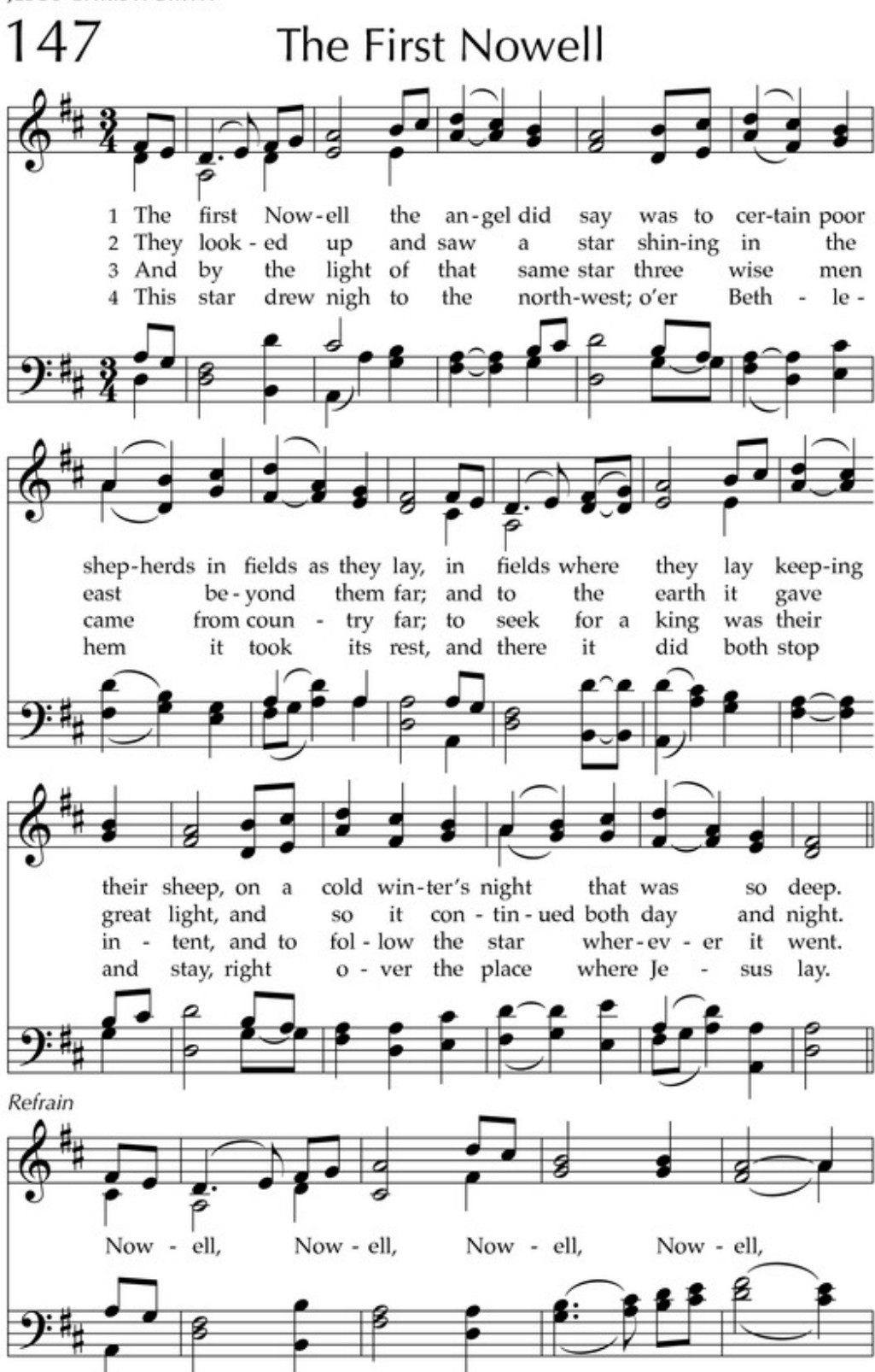
"Nowell" is the English form of the French "noel," a shout of joy formerly used at Christmas (as in Chaucer's "Franklin's Tale"), a clue that the word is older than its first printing. It may have Latin and French roots related to "born" (natus | né) as well to "news" (nova | nouvelle).