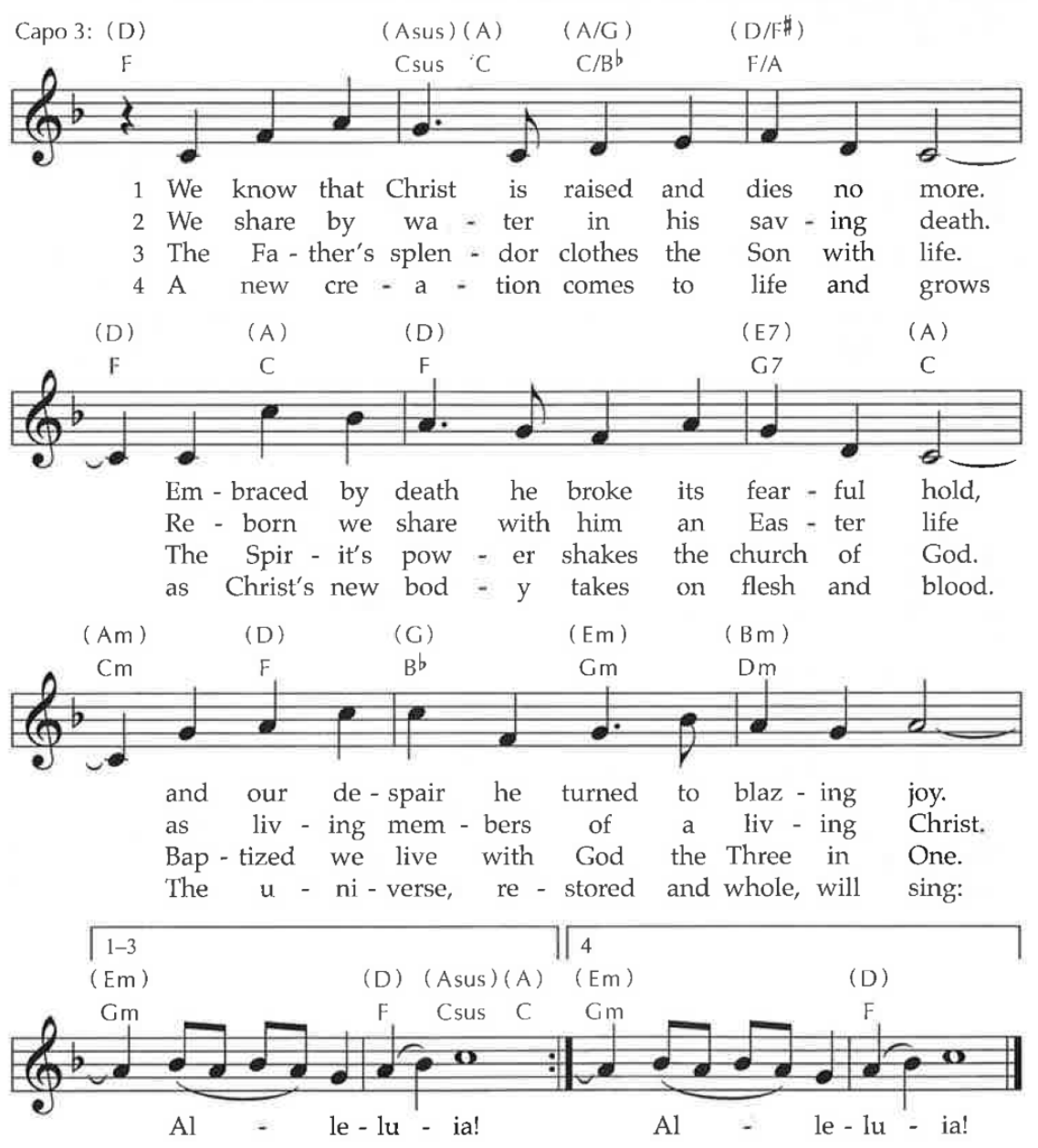
Guitar chords do not correspond with keyboard harmony.

Beginning with an allusion to Romans 6:9, this exuberant baptismal hymn unfolds the implications of our incorporation into Christ's new life, making us "a new creation" (2 Corinthians 5:17). The text was written to fit this expansive tune by a distinguished British composer.