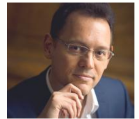
Represented in North America exclusively by Phillip Truckenbrod Concert Artists, LLC.