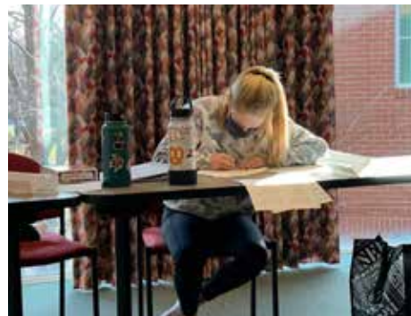
Above, confirmands at Louisville Seminary.