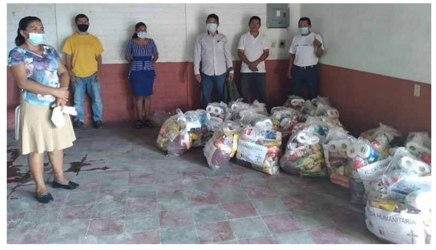
Through our Covid-19 Emergency Mission Fund we were able to share grace with our partners in Rosario de Mora El Salvador by providing much needed food packets for families in the community.