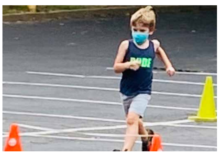
Activities included races, bean bag tosses, and other games to stretch bodies and minds.