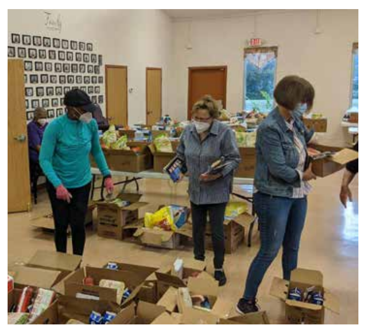
Preparing to distribute the donated food