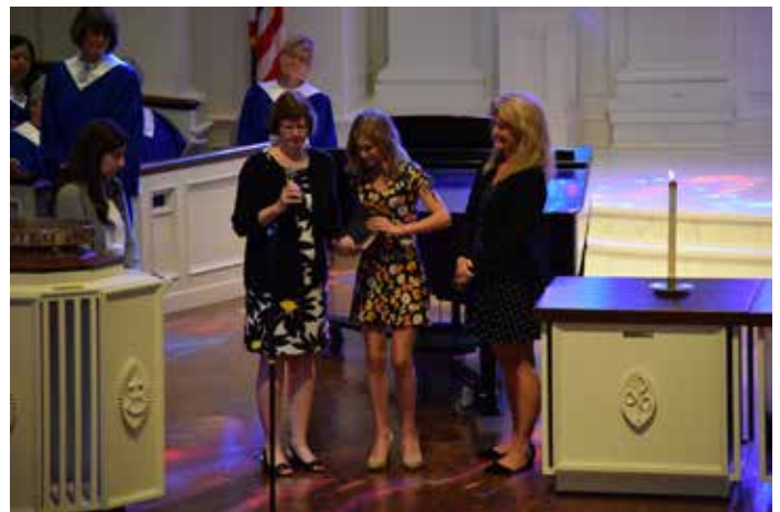
Presentation of confirmand Bibles

Each year, we invite our 8th graders to participate in the Confirmation Program. Through this class, they not only are able to learn more about the Reformed tradition and basic beliefs, but also are challenged to examine their own faith and relationship with God. They can choose at the end of Confirmation whether or not they are ready to make that public profession of faith that is required to become a member of the church. This class will also help them articulate their faith and give them words to be able to do so. Guided by adult mentors, the confirmand and adult mentor participate in a variety of ways in the church life so they are able to see different ministries at Second. These opportunities include ushering and greeting, serving at one of our mission partners, delivering home communion, and so much more.