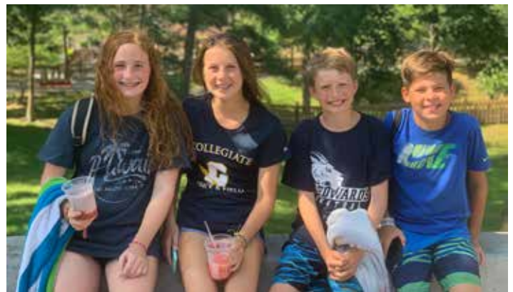
Some of our middle school class enjoying Holiday World