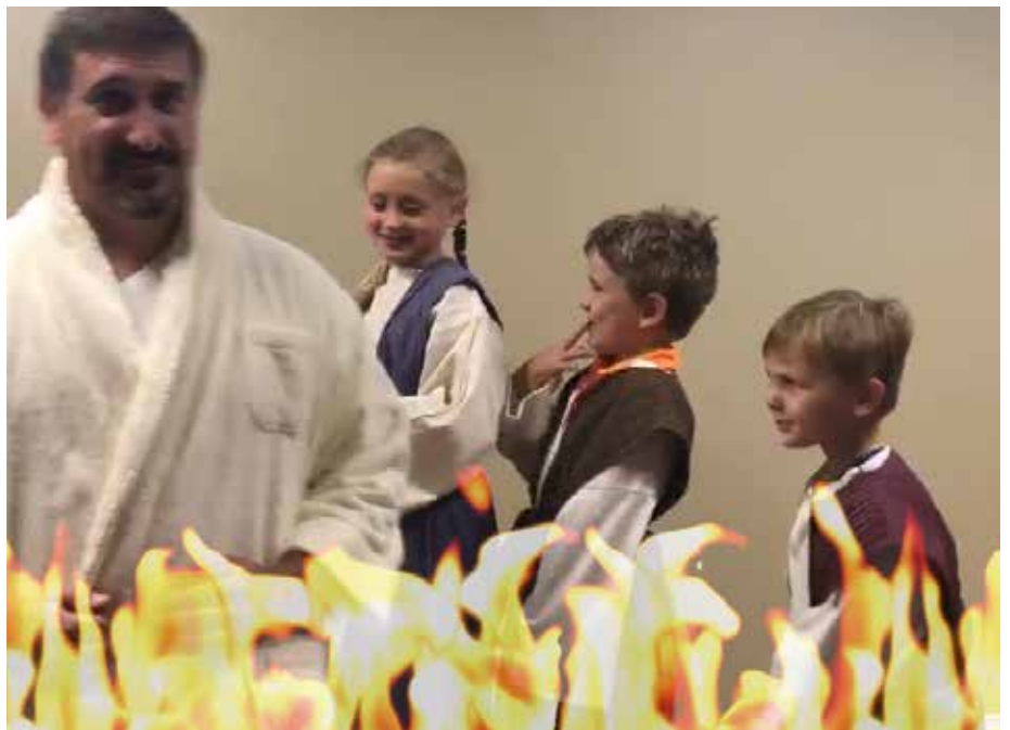
"A Fiery Furnace," the Hughes family