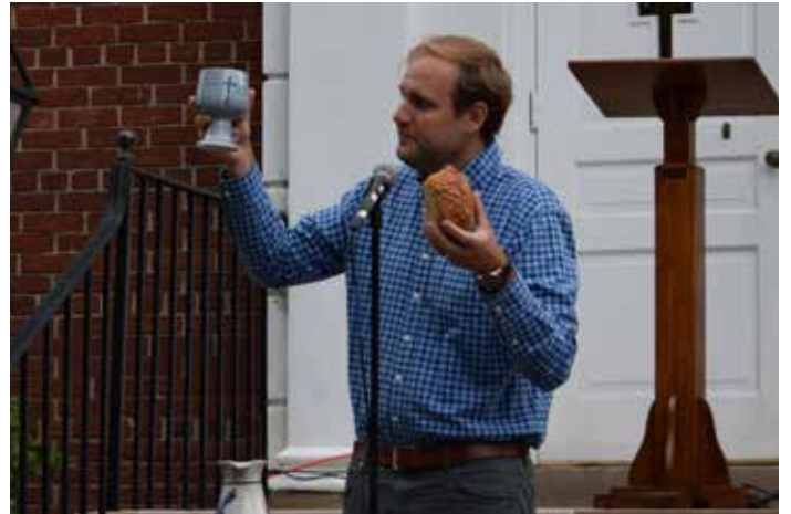
We were able to take Communion in August both at both our outdoor service and online.