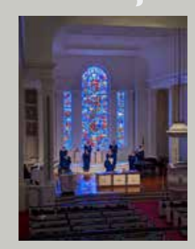
March 15 - Third Sunday of Lent Livestream