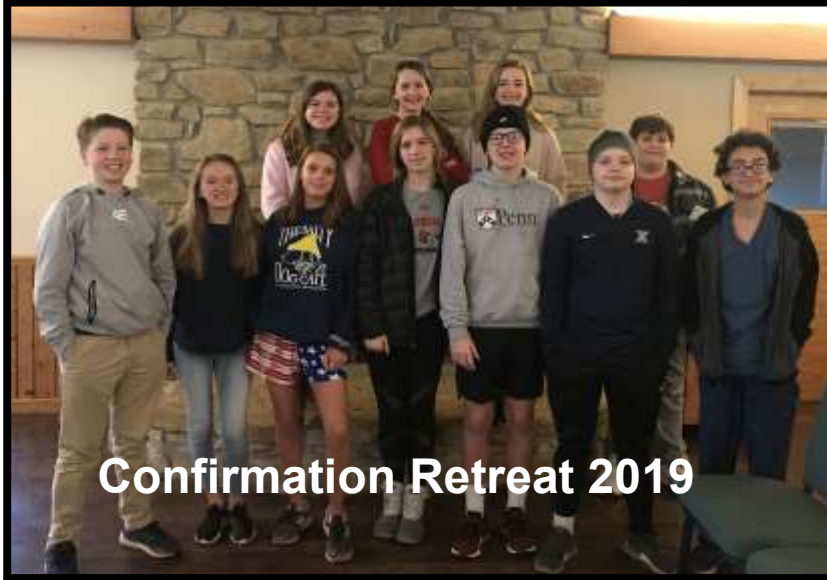
Confirmation Retreat 2019