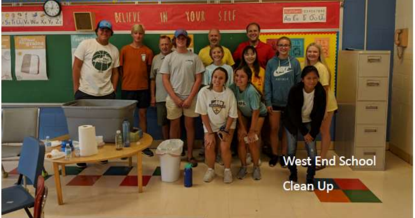
West End School Clean Up