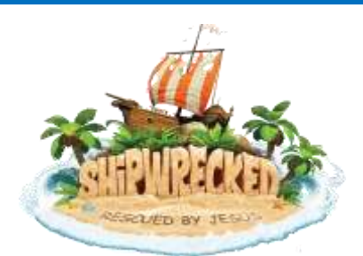
SHIPWRECKED VBS July 9—13 9a-12p (Potty-trained 3's—completed 3rd grade)