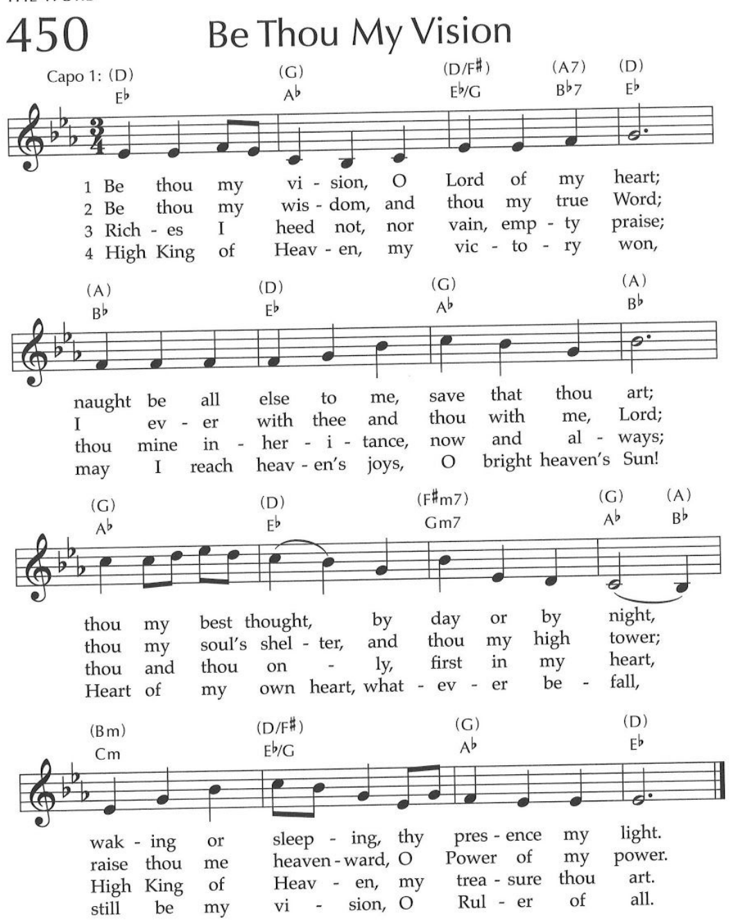
Guitar chords do not correspond with keyboard harmony.

These stanzas are selected from a 20th-century English poetic version of an Irish monastic prayer dating to the 10th century or before. They are set to an Irish folk melody that has proved popular and easily sung despite its lack of repetition and its wide range.