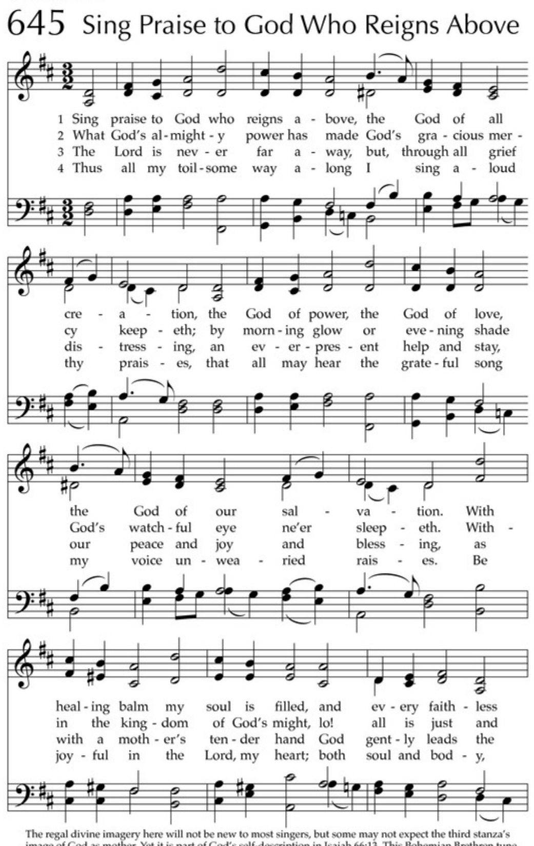
image of God as mother. Yet it is part of God's self-description in Isaiah 66:13. This Bohemian Brethren tune resembles both Genevan psalm tunes and French folk songs.