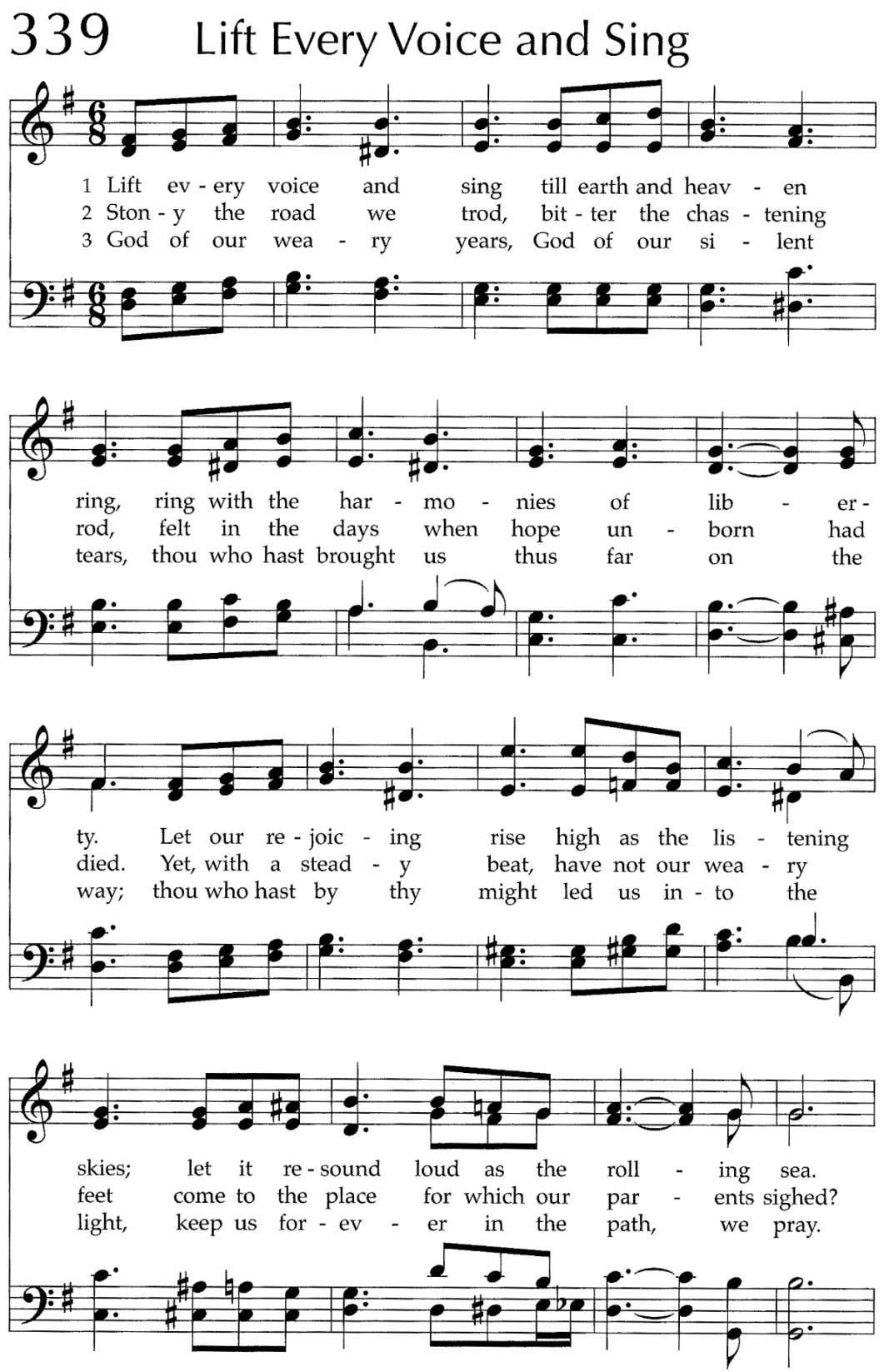
Initially a poem for a school assembly at which Booker T. Washington spoke on Lincoln's birthday in 1900, this text and tune have gained national recognition and devotion, not only within the African American community, but also among all who seek liberation from oppression.