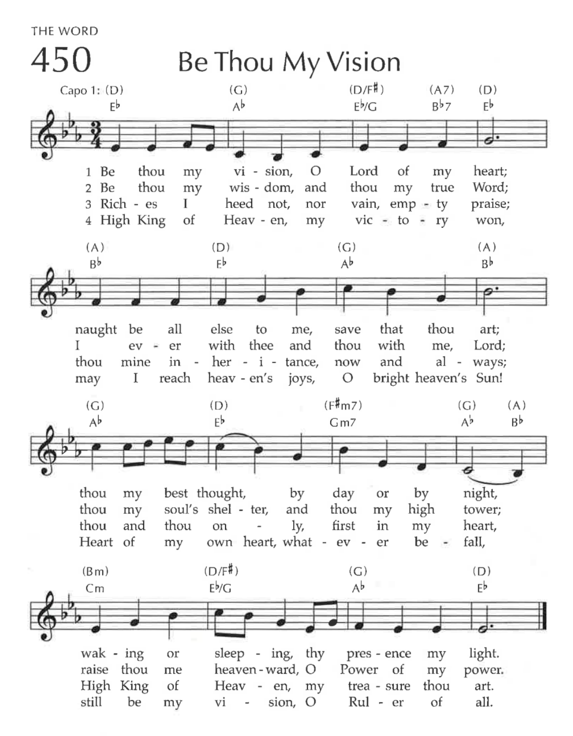
Guitar chords do not correspond with keyboard harmony.

These stanzas are selected from a 20th-century English poetic version of an Irish monastic prayer dating to the 10th century or before. They are set to an Irish folk melody that has proved popular and easily sung despite its lack of repetition and its wide range.